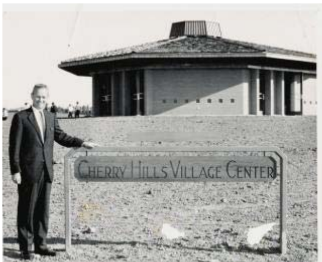
Mayor Davis outside the then new Village Center in 1963.

By 1982, Cherry Hills Village had outgrown its building. In its sixth bond election, the City Council asked the electorate to approve a general obligation bond in the amount of $450,000 to expand and remodel the existing structure to accommodate the expanded police department and the municipal court. A fact sheet that went out said, "Existing space is very cramped, and additional space is required so that we may serve you in a more dignified and efficient manner." The bond issue passed and, with that, we came to have the Village Center which serves us today.