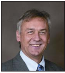
MAYOR MIKE WOZNIAK

I am happy to report the following City Council activities: