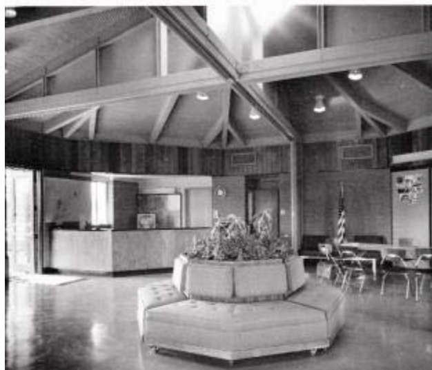
The interior of the Village Center before remodel in 1982.

CALL FOR PHOTOS If you have some good photos which show the Village in its early stages or of early Village residents and are willing to let us duplicate them for the history project, please call either Lori Auttersen at 303-781-7733 or Klasina VanderWerf at 303-694-4586 .