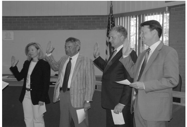
L to R: Councilmember from District 6, Harriett LaMair; Mayor Mike Wozniak; Councilmember from District 2, Russell Stewart; and Councilmember from District 4, Scott Roswell, are sworn in.

In 2002 when the City conducted the Municipal Election by Mail Ballot, it cost $8,781.52 to mail 4,137 ballots and 1,332 citizens (about 32%) of registered voters cast ballots.