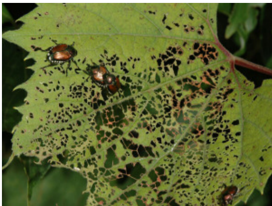
Japanese Beetles can devour entire plants and often reduce leaves to lacy skeletons