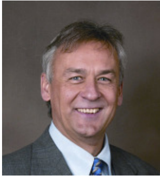
MAYOR MIKE WOZNIAK

Council has been focusing on budgetary issues for both the 2009 and 2010 budget. As Mayor, it is incumbent upon me to insure that our budget remains balanced and that the City remains in strong fiscal shape. This often creates difficult balancing of priorities as we estimate revenues to be received from property taxes, vehicle registration taxes and sales taxes and try to meet all of our residents' needs.