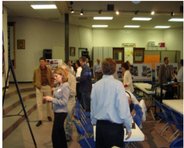
Residents attend September 23rd Public Workshop

There will be one final public event before Norris Design and SEH present their final recommendations to the City Council. Residents are asked to consider attending a