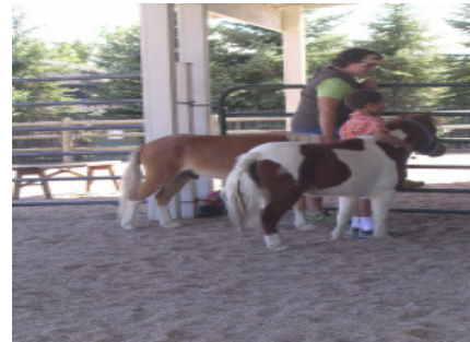
Miniature horses at the Bristow barn