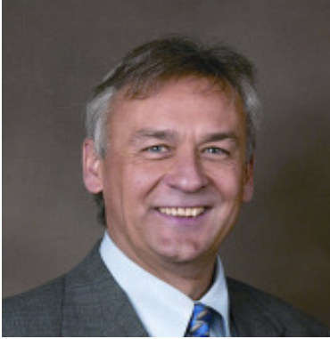
Mayor Mike Wozniak

Hope your summer has been safe and happy! Your City Council has been busy.