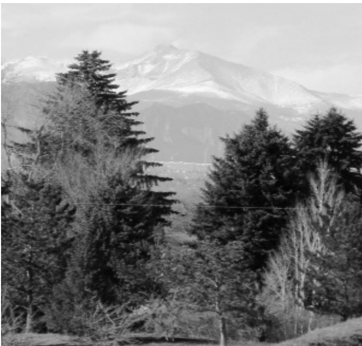
Scenes on this trail walk include mountain vistas and Little Dry Creek..

The Cherry Hills Village Parks and Trails Map is available, free of charge, at the Cherry Hills Village Center. It is easy to read, is well organized and folds up nicely credit card size. Every resident should have one. But promise yourself this: open it, use it and explore the many trails less traveled in Cherry Hills Village... and that, I promise, will make all the difference.