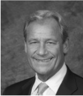
Mayor Doug Tisdale

“The way lies past these clouds of light.”