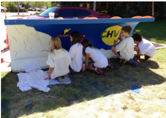
On a beautiful September day Cherry Hills Village Elementary students paint their plow.