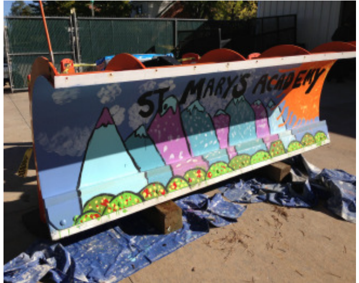
Plow decorated by St. Mary's Academy students

Art in Public Places takes on MOBILITY and a new meaning through this creative experience for kids within the community, yet “outside of the classroom,” and will be visible and fun to see all winter long.