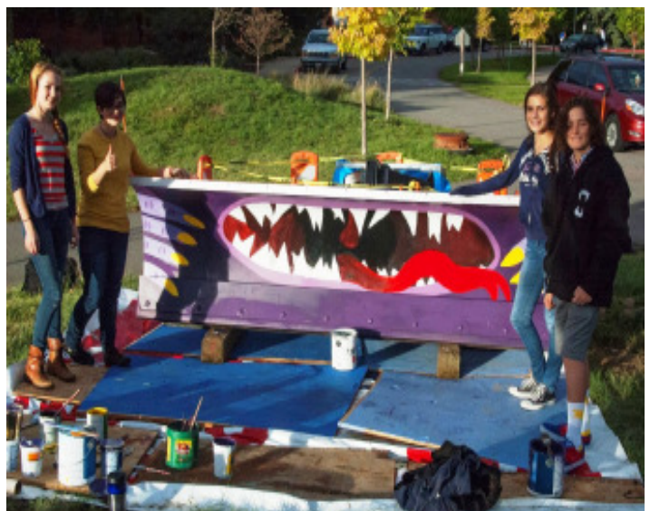
Kent students proudly show off their handi-work