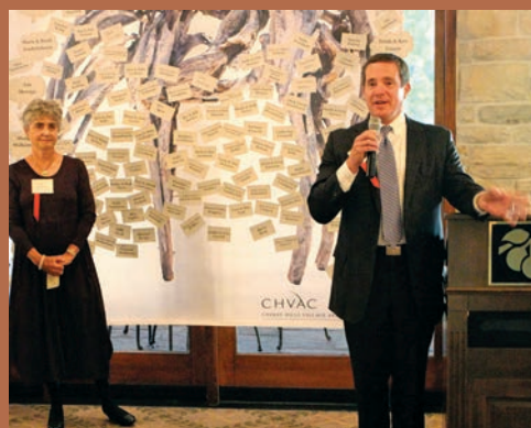
ABOVE: The representation of sponsorship toward the goal of raising enough money to keep the bronze horse at CHV.