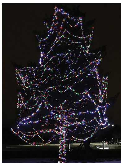
MIDDLE: Tree lights sparkle in the Village.

T he Holiday Tree Lighting sponsored by the Parks, Trails and Recreation Commission was an enormous success again this year. Residents were able to visit with Santa, ride a holiday train in the parking lot, have their face painted and enjoy a carriage ride driven by Clydesdale horses up and down Meade Lane. City employees were on hand to serve hot chili, apple cider, hot chocolate and cookies to all the attendees.