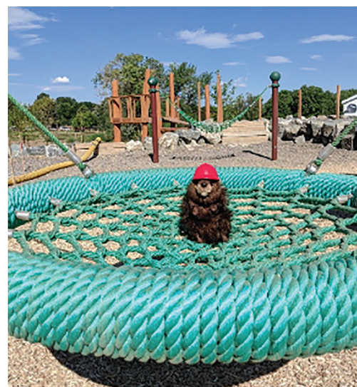
Max the Muskrat, park mascot, on the saucer swing

WE ARE SO EXCITED TO WELCOME YOU BACK TO SEE ALL THE NEW IMPROVEMENTS!