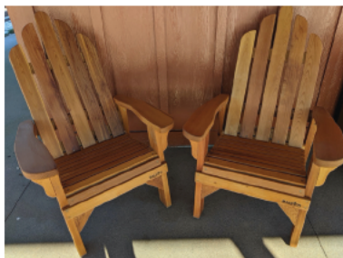
Photos: Sideways Tree Climber (top) Baldwin Adirondack chairs (left)