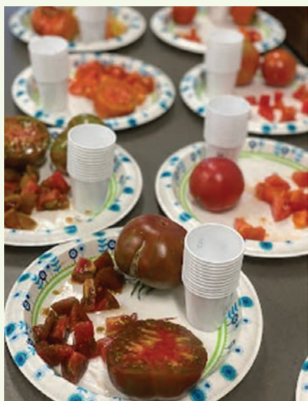
All field-grown tomatoes were blind taste-tested. Participants tasted all 12 varieties and rated them for several flavor profiles.