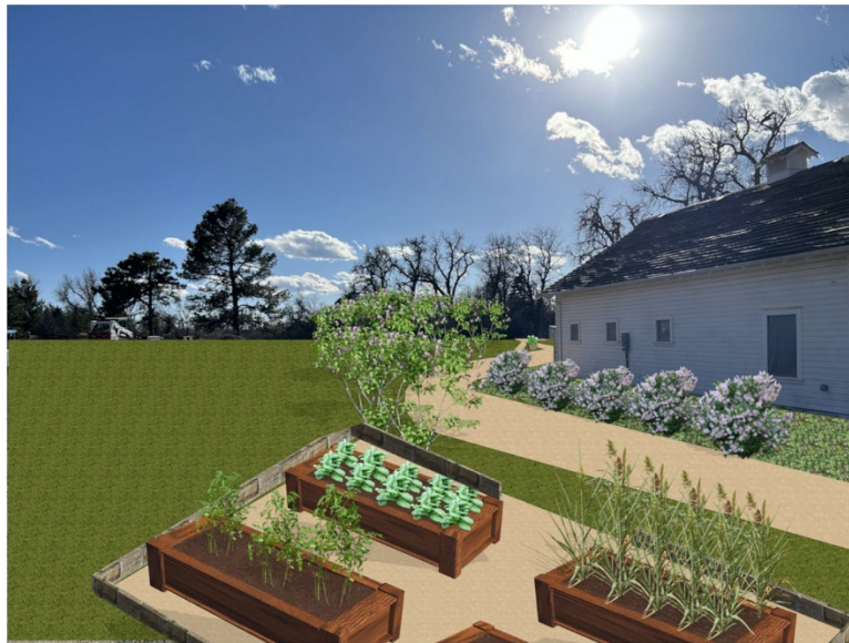
Sample image from Landscape Plan

The City will continue to revitalize the dryland pastures on the east side of the Farm, using guidance from the report and recommendations provided by CSU Extension specifically for the property. Weed treatment will continue to be provided by the City's contractor (Weed Wranglers).